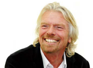
Richard Branson has Dyslexia and ADHD 2015 Net worth: $5.1 Billion

Chaffey College's Disabled Students Programs and Services, or DPS, serves an estimated 1500 students across all Chaffey campuses. DPS serves students with physical, learning, and psychological/psychiatric disabilities by providing accommodations based on the type of disability and verifying documentation. Services include academic counseling, disability related counseling and referral for community resources, test accommodations, tram services, adapted computer lab, assistive technology training, assessment, and equipment loan. (909) 652-6379.