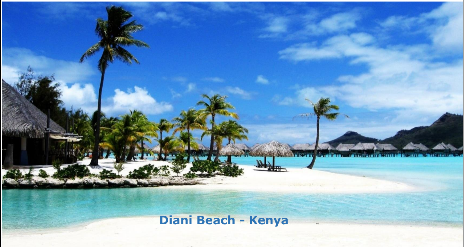
Diani Beach - Kenya