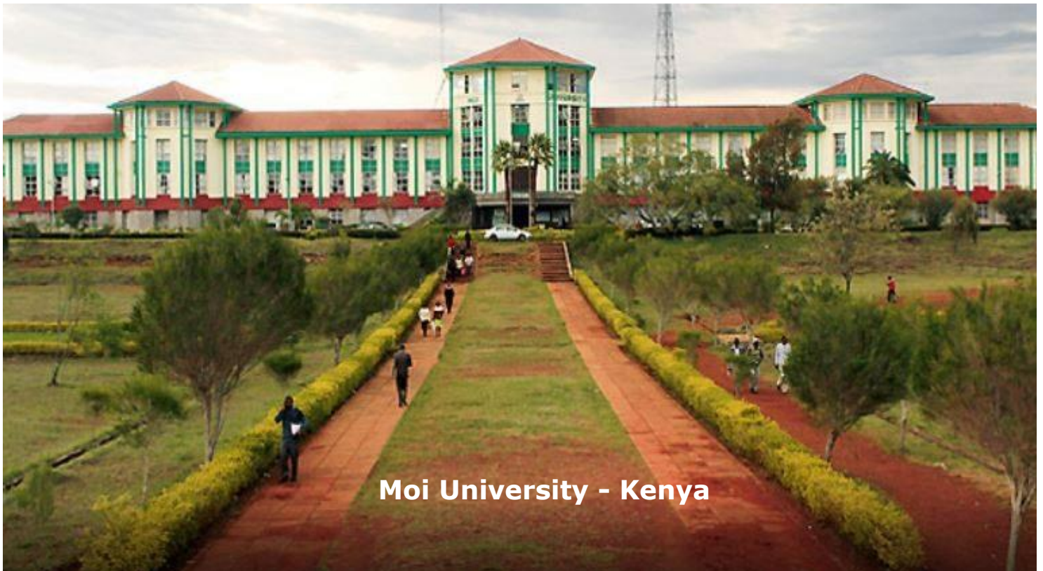
Moi University - Kenya