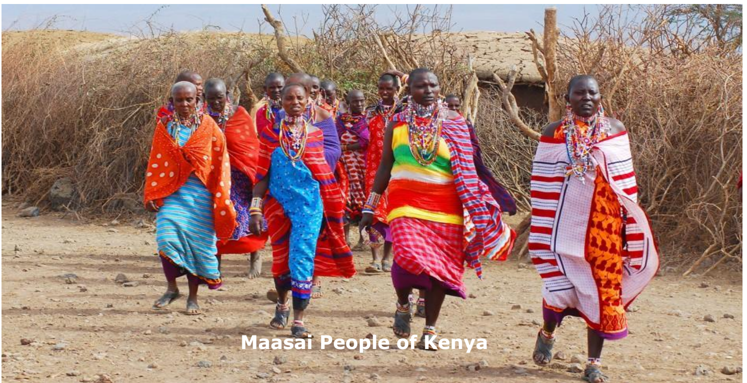
Maasai People of Kenya